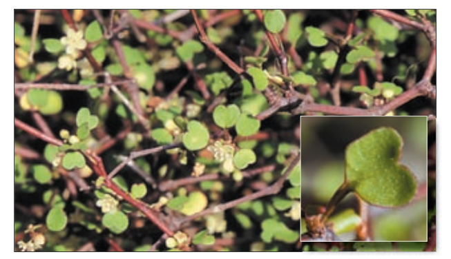
Shrubby tororaro, Muehlenbeckia astonii.

A nationally threatened plant, the shrubby tororaro, Muehlenbeckia astonii , occurs within the reserve. A new population of shrubby tororaro was established at Turakirae Head in 1998 as part of a programme to avert the extinction of the species.