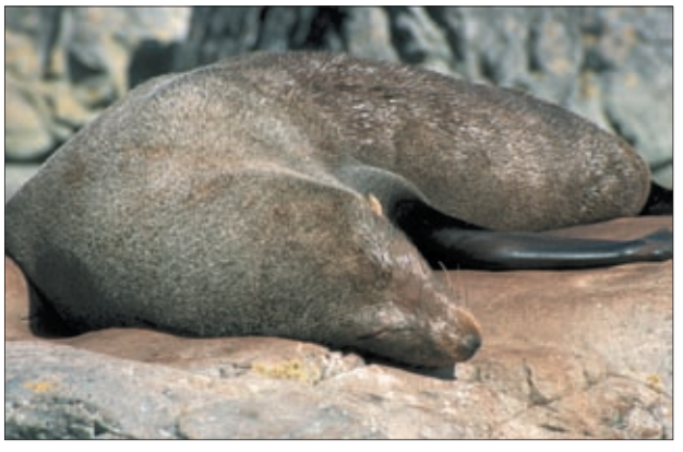
NZ fur seal.

This colony began in 1950 and has steadily increased since then to become the largest haulout on the south Wellington coast.