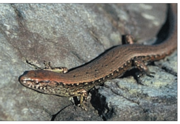
Copper skink.

Turakirae Head Scientific Reserve also provides habitat for a variety of native birds and reptiles. Banded dotterel, caspian tern and variable oystercatcher are among the bird species that may be observed. Copper skink, spotted skink, common skink and common gecko are all present within the reserve.